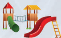
Childrens play Area