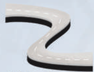
Wide Concrete road